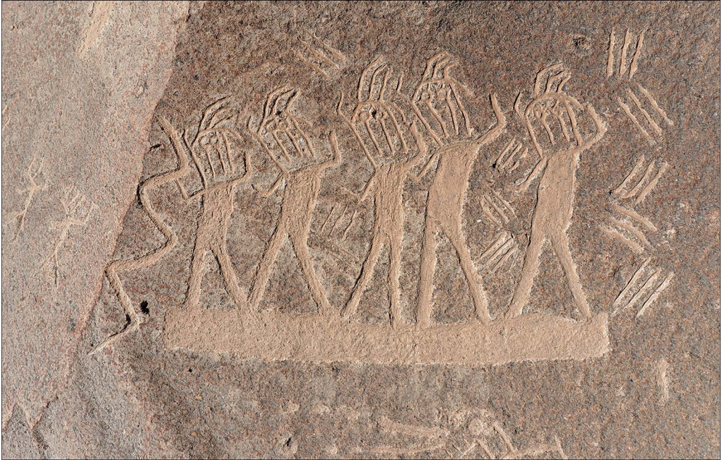
Figure 4. The 'dancer' is one of the most common motifs in Toro Muerto iconography (TM 1646).