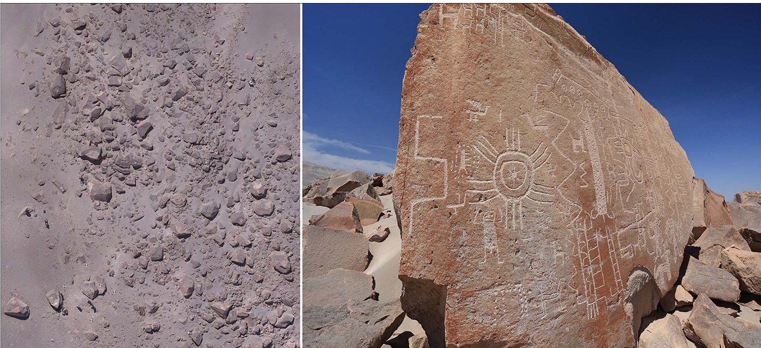
Figure 3. Aerial photograph of sector X (left) and TM 2498—its most spectacular boulder (right).