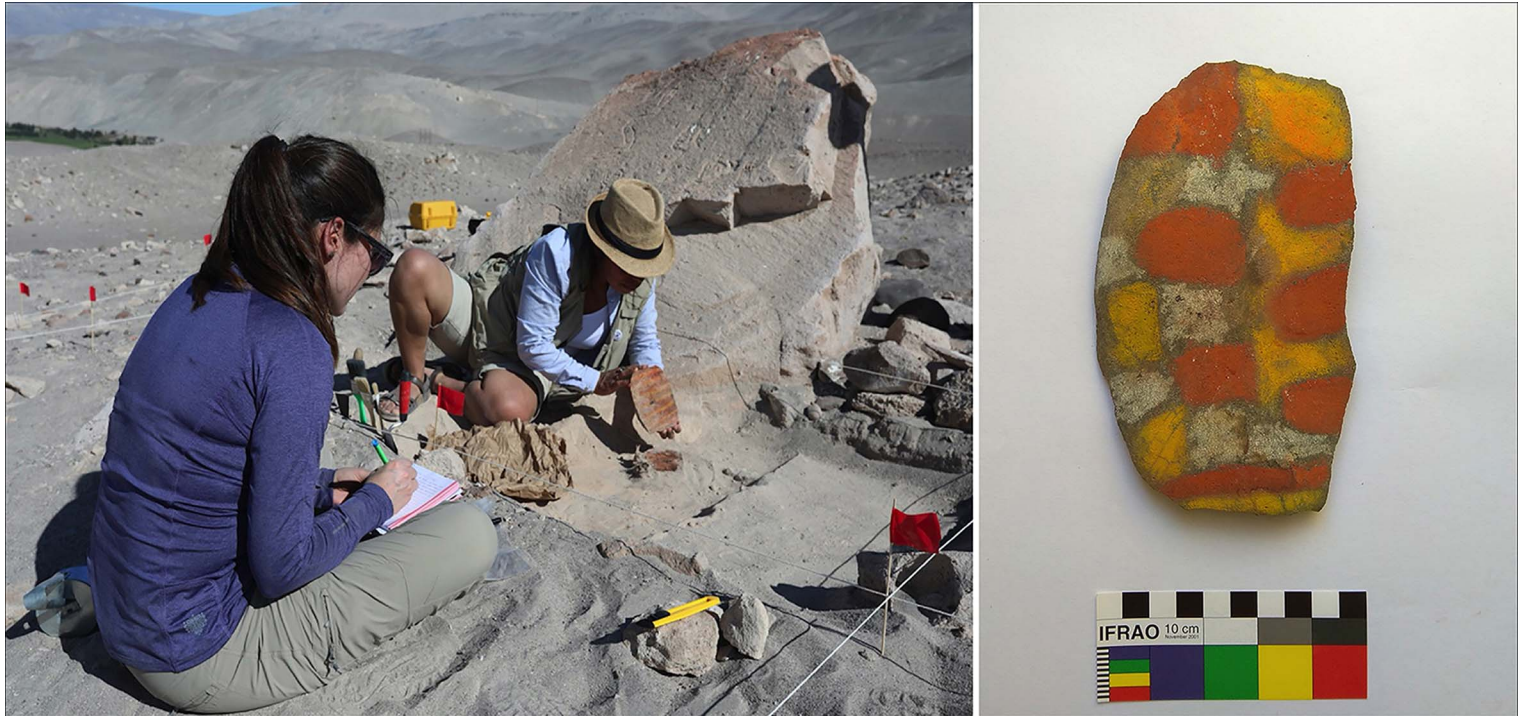
Figure 6. Votive stone tablets painted with vivid colours (right) were popular offerings to deposit (left) next to boulders.