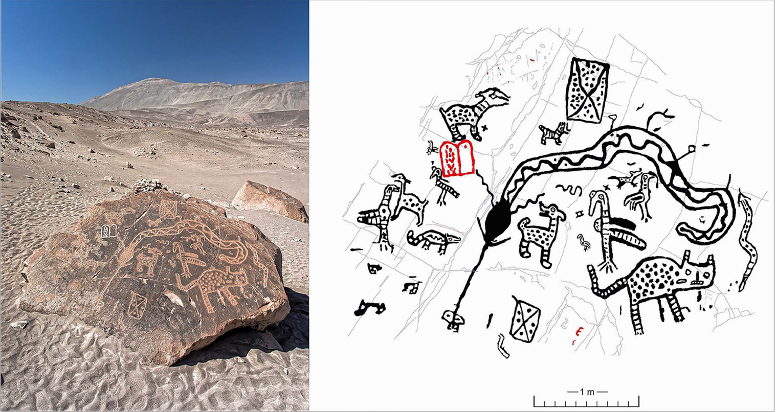
Figure 2. Left) Toro Muerto boulder TM 1677 exhibiting particularly rich iconography; right) modern graffiti (in the form of Tablets of Stone) is marked with a red line.