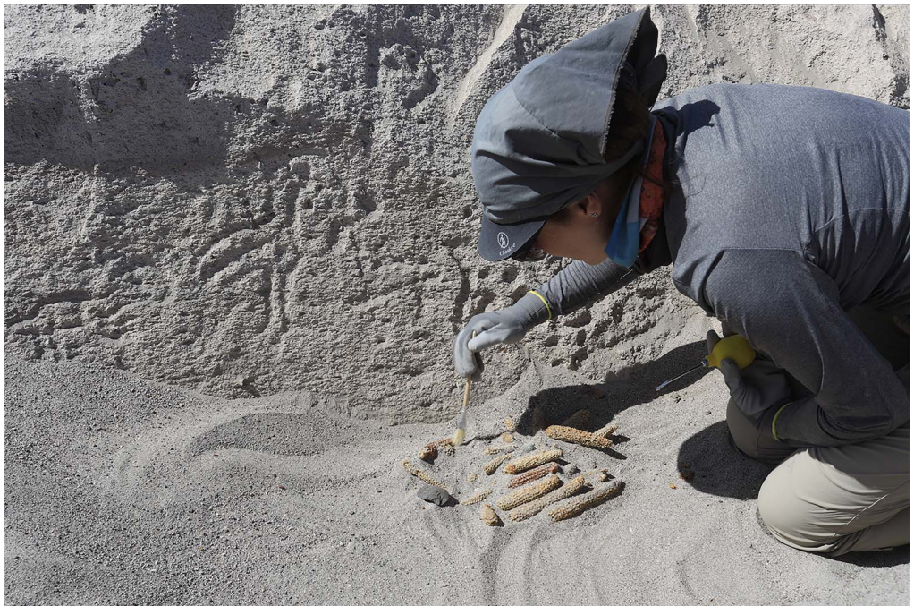
Figure 5. Excavating an offering of corn cobs deposited adjacent to boulder TM 0252.